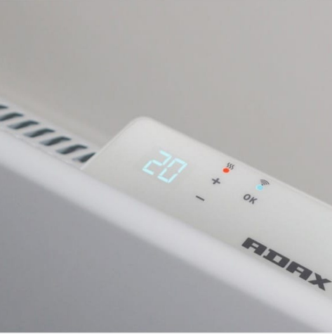
Scan for video